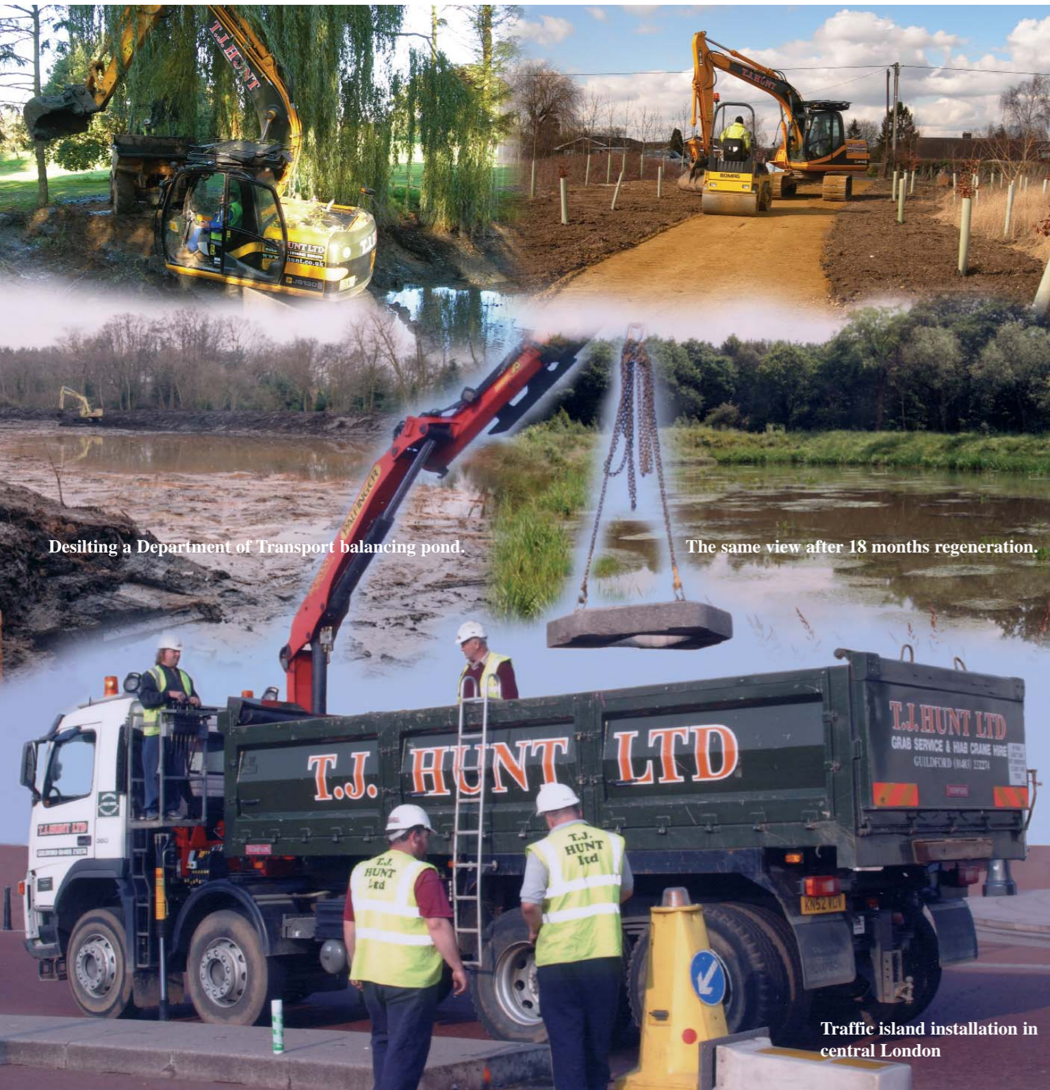
Desilting a Department of Transport balancing pond.

Our investment in new plant and vehicles has given us the capability to take on the most demanding projects. We aim to offer value for money together with safe, quality services to all our clients.