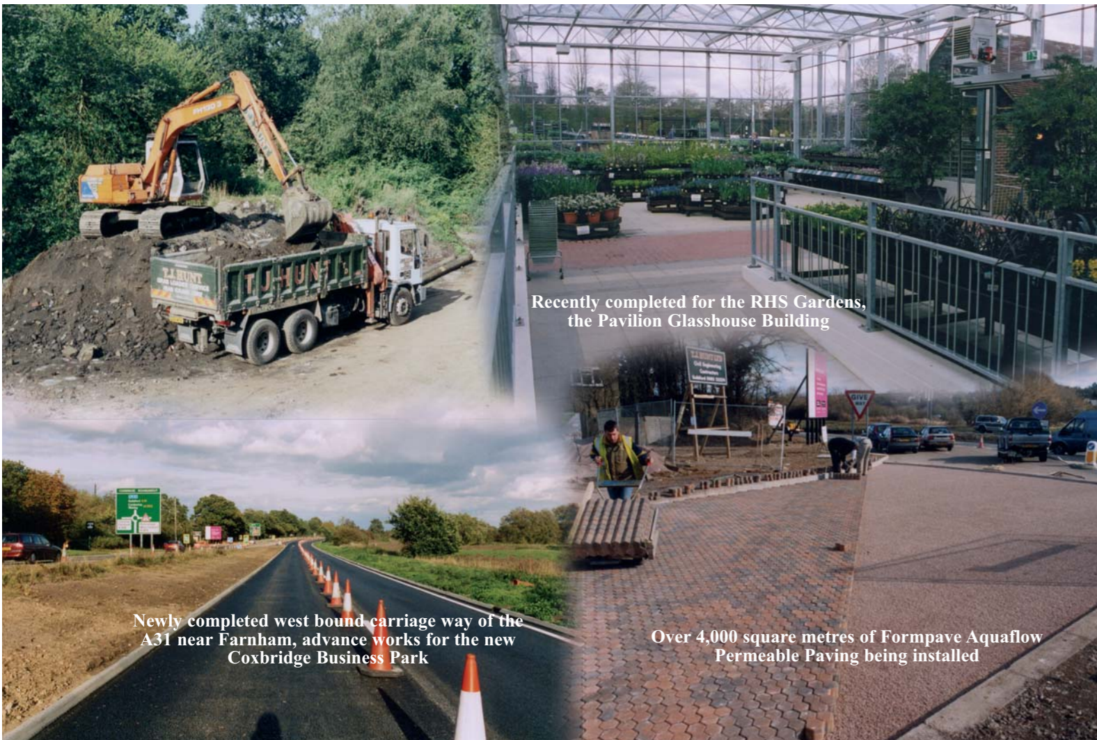
Recently completed for the RHS Gardens, the Pavilion Glasshouse Building

This illustrates our attitude to environmental responsibilities in our business activities, and our commitment to ensuring our operations fully comply with all the guideline principles of sustainability and environmental protection.